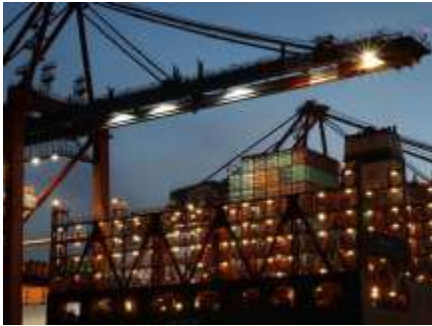
Ports & marine