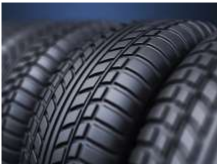
Rubber, Tire, plastic