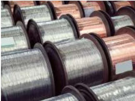
Wire and cable