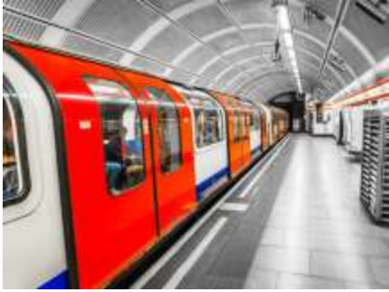
Transit & Metro