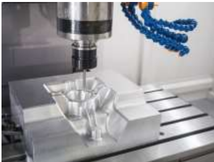
Dies & Moulds