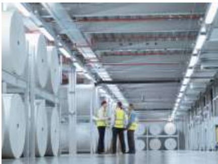
Pulp and paper